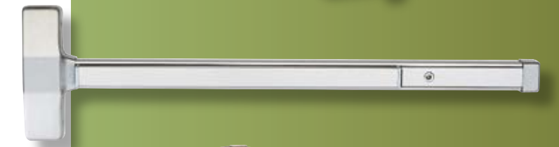
King Cobra 2